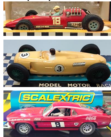
Some prior year Auction Lots

We will have another varied and interesting auction with confirmed 222 lots.